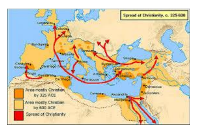
Yr8 Term 1 Religion: Examining and plotting the spread of a religion