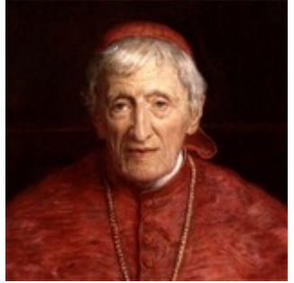
John Henry Newman

Therefore, I will trust Him, whatever I am, I can never be thrown away. If I am in sickness, my sickness may serve Him, in confusion, my confusion may serve Him. If I am in sorrow, my sorrow may serve Him. He does nothing in vain. He knows what He is about. He may take away my friends. He may throw me among strangers. He may make me feel desolate, make my spirits sink, hide my future from me. Still, He knows what He is about."